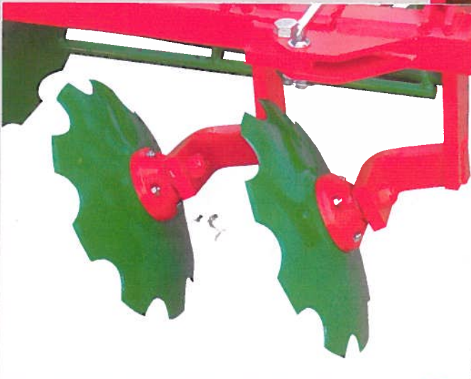
Side discs in option