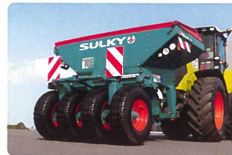
As an option directional front packer, PACK DRIVE with large tyres, 11.5/80-15 in the front position providing dynamic soil firming, less power consumption and better distribution of masses whatever the weight of the hopper.