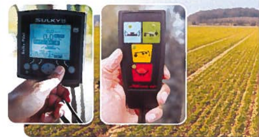
As standard, the XEOS TF front hopper incorporates the PILOT console with onboard radar. Optional on folding versions, the selector enables 4 hydraulic functions to be combined.