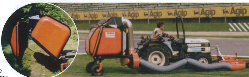
Jet and rear collector at Imola