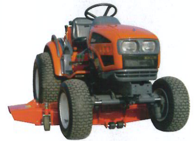
Mid-mounted Jet available for Kioti 'CK' Series tractors – side or rear discharge