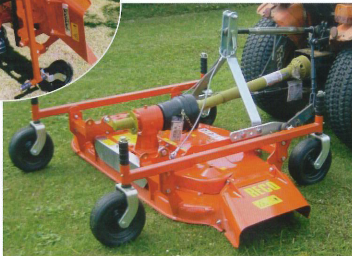
The ultimate finishing mower