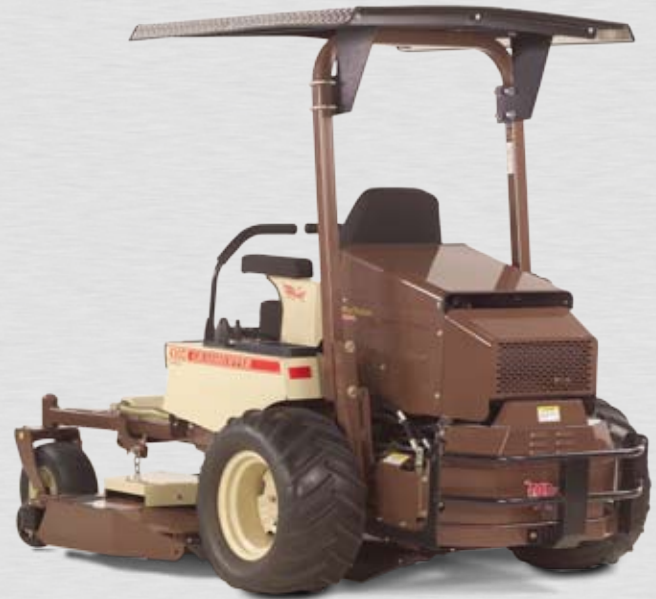
Shown with optional aluminum sunshade canopy.