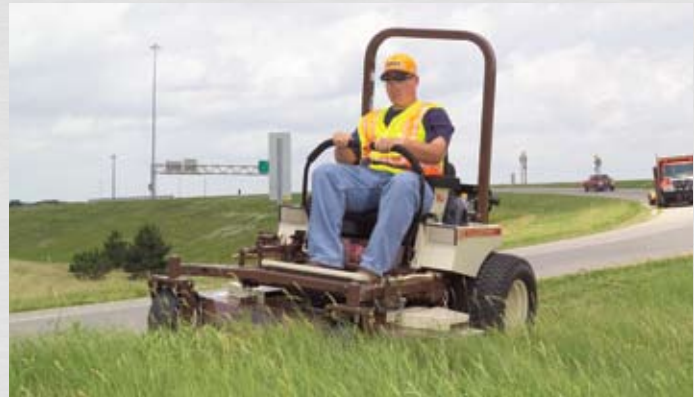
Knock down the tall stuff and throw the clippings out back.